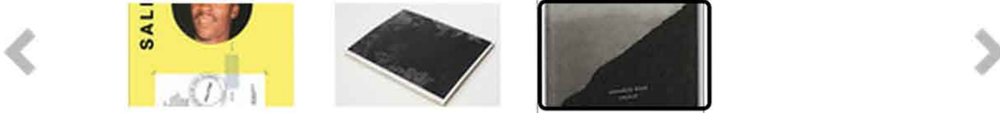
Jungjin Lee « Unnamed Road » (MACK, 2014) – selected by Wendy Ewald for the Best Photobook Award Kassel 2015

Since 2008 the Fotobookfestival has been asking experts to name their favorite photobook of the previous year and to justify their choice. The result is a selection of about 30 books from renowned jurors from all over the world. The books showcase the current state of play in a medium that is incredibly lively and mobile. The books showcase the current state of play in a medium that is incredibly lively and mobile. As forms, they range from very simple magazine-style publications to traditionally crafted books as well as handmade one-off items and heavy, exclusive, large format products in slip cases and cassettes. The essence of printed photography and the strong narrative force of photography in book form can be seen in the high-class selection of books included every year. Some of the works are already among the masterpieces and classics in the history of photography, while others are still waiting to be discovered.